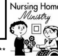
Nursing Home Ministry

AREA WIDE SING & POTLUCK: TODAY is the area wide sing that East Allen is co-hosting with East Chestnut. See the bulletin board for the schedule of events for this afternoon. East Allen WILL be having services this evening. We will be viewing the third dvd of the Marriage Matters Series.